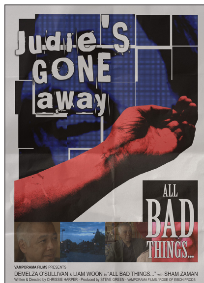
Indie film poster design.

I'm eager to find new & interesting opportunities, and try new things whenever possible, while studying and refining existing skills.