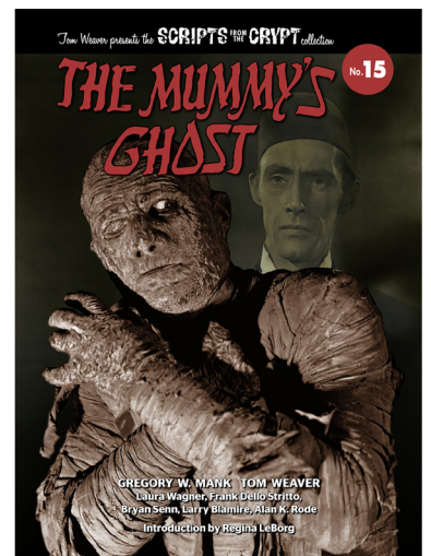
Scripts from the Crypt book cover design.

A long interview which I co-filmed and edited was used as a Blu-ray bonus feature by Arrow Video. In late 2019/early 2020, I worked on a local area magazine show for YouTube.