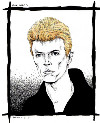
Pen & ink portrait of David Bowie.

My work experience in editorial, layout, design and journalism starts in the 1990s, on a variety of fanzines and professional magazines, covering subjects including horror movies, comic books and even health & fitness. In the late '90s and early '00s, I spent a while working for American publishers, in editorial, design and layout.