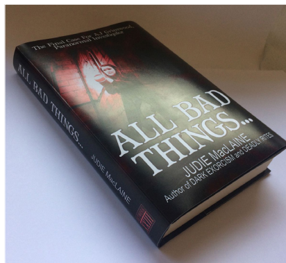
Prop book design for short film.

space artist David A Hardy, the late actress Edith Scob, and the late director Norman J Warren. I was also involved in making four short, independent films. This work involved writing, directing, editing, production design and storyboards.