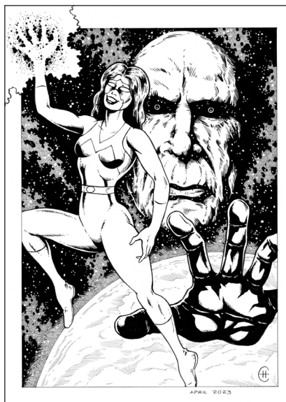
Superhero comic book art!

I'm eager to find new & interesting opportunities, and try new things whenever possible, while studying and refining existing skills.