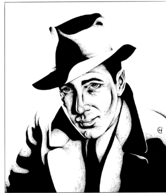
Pen & ink portrait of Bogie.

My work experience in editorial, layout, design and journalism starts in the 1990s, on a variety of fanzines and professional magazines, covering subjects including horror movies, comic books and even health & fitness! In the late '90s and early '00s, I spent a while working for an American publisher, in editorial, design and layout.