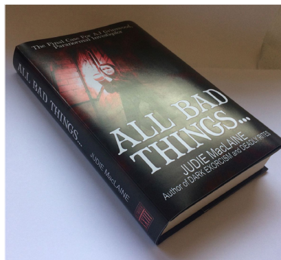
Prop book design for short film.